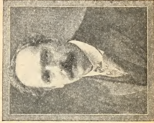
ARTHUR EDWARD WAITE, Whose well-known works on mysticism have been supplemented by his collected poems.

everything. Hence his poetry can make no appeal to the mind attuned only to reality. To him the real is the subject and object of Quest. It lies behind the curtain of the material world. "The Collected Poems of Arthur Edward Waite" (W. Rider and Sons, 2 vols., 21s. net) are beautiful to the eye and touch.