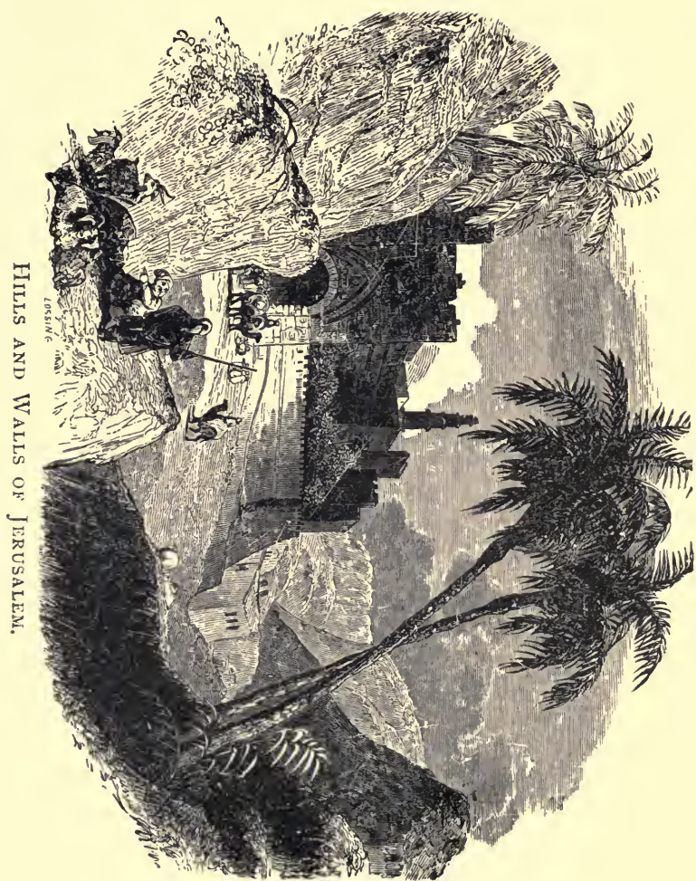
HILLS AND WALLS OF JERUSALEM.