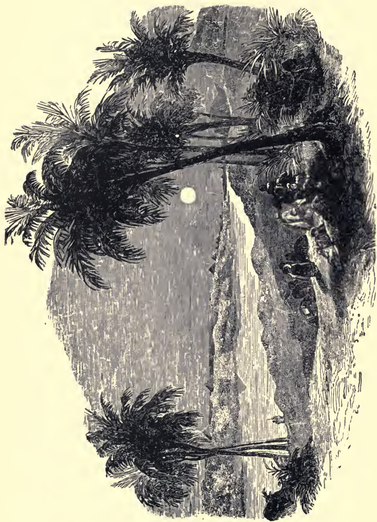
VIEW OF THE RIVER NILE.