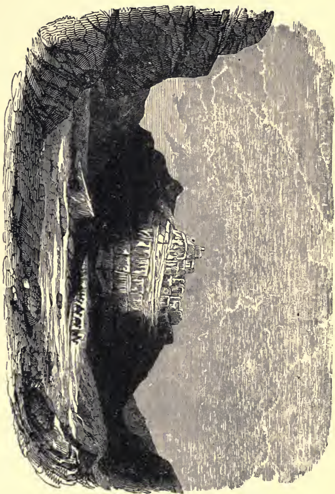
TOMB OF HIRAM ABIF.