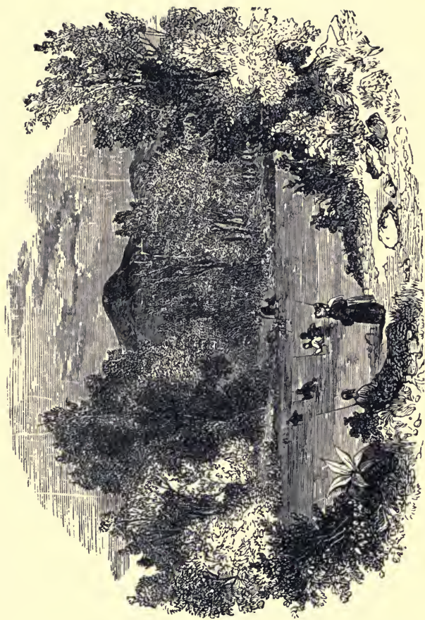
DR. TALMAGE BAPTIZING IN THE RIVER JORDAN.