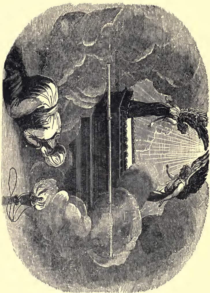
FORM OF THE ARK OF THE COVENANT.