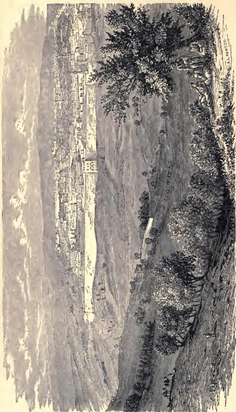
THE CITY OF JERUSALEM.