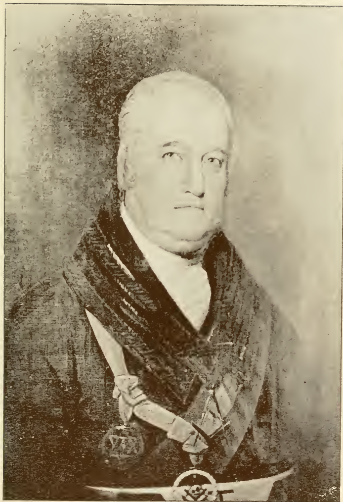
THE HONORABLE CLAUDE DÉNÉCHAU, M.P.P. PROVINCIAL GRAND MASTER OF UNITED "ANCIENT" FREEMASONS OF LOWER CANADA, A.D. 1813-22; AND DISTRICT G.M. OF QUEBEC AND THREE RIVERS, 1823-36.