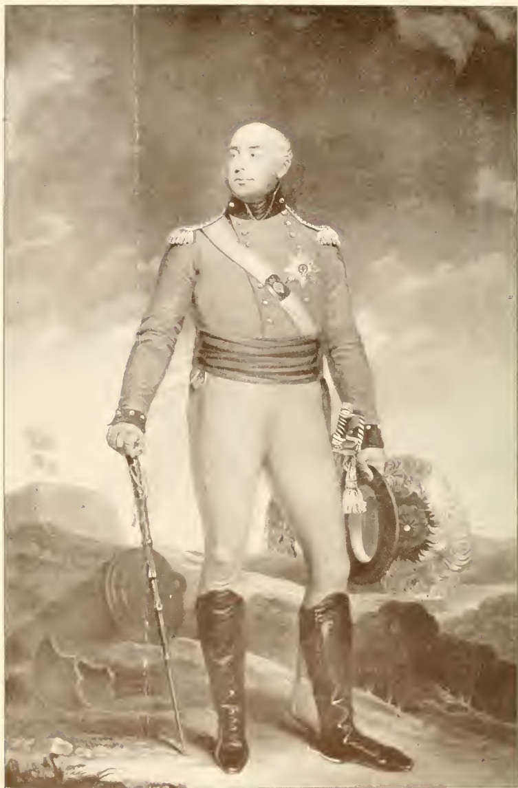
HIS ROYAL HIGHNESS PRINCE EDWARD DUKE OF KENT.

PROVINCIAL GRAND MASTER OF "ANCIENT" FREEMASONS OF LOWER CANADA, A.D. 1792-1812 G. M. "ANCIENTS," ENGLAND, 1813; GRAND PATRON OF MASONIC KNIGHTS TEMPLAR OF ENGLAND, 1791-1820; AND GRAND PATRON- PROTECTOR M. K. T. SCOTLAND, 1811-23.